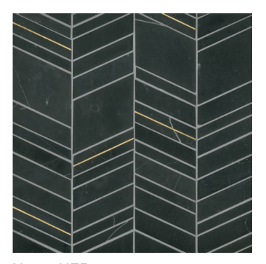
Nero - NER DECFERNERCHEMOH Chevron Mix Size Mosaic with Brass - Honed (10 3/4*x12* Sheet)