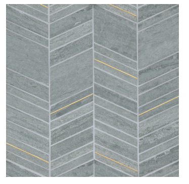
Argento - ARG DECFERARGCHEMOH Chevron Mix Size Mosaic with Brass - Honed (10 3/4*x 12* Sheet)