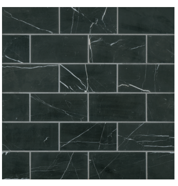
Nero - NER DECFERNER36H 3"x6" Field Tile - Honed