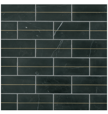
Nero - NER DECFERNER36DECOH 3"x6" Decorative Tile with Brass - Honed