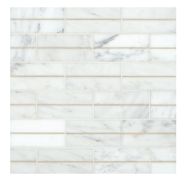
Bianco - BIA DECFERBIA36DECOH 3"x6" Decorative Tile with Brass - Honed