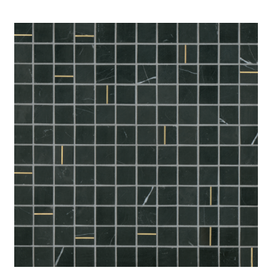
Nero - NER DECFERNER11MOH 1"x1" Mosaic with Brass - Honed (113/4"x113/4" Sheet)