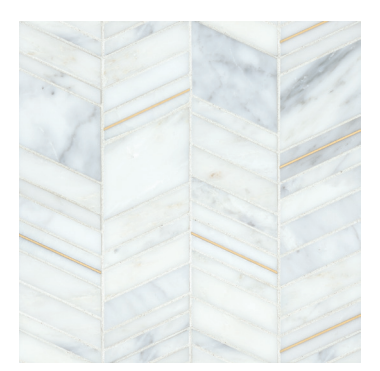
Bianco - BIA DECFERBIACHEMOH Chevron Mix Size Mosaic with Brass - Honed (10 3/4*x 12* Sheet)