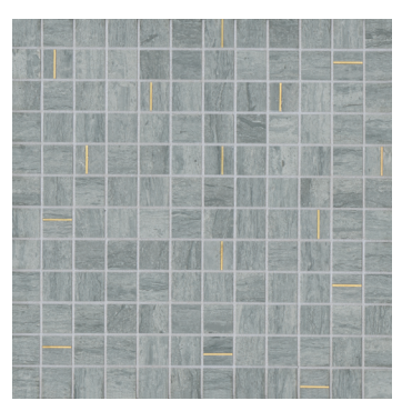
Argento - ARG DECFERARG11MOH 1"x1" Mosaic with Brass - Honed (113/4"x113/4" Sheet)