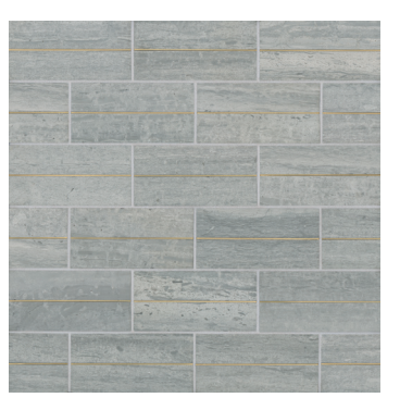
Argento - ARG DECFERARG36DECOH 3"x6" Decorative Tile with Brass - Honed