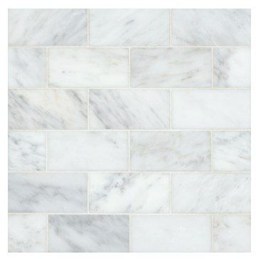
Bianco - BIA DECFERBIA36H 3"x6" Field Tile - Honed