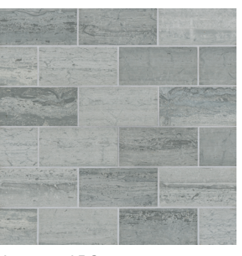
Argento - ARG DECFERARG36H 3"x6" Field Tile - Honed