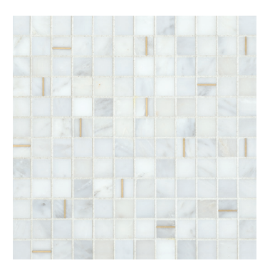
Bianco - BIA DECFERBIA11MOH 1"x1" Mosaic with Brass - Honed (11 3/4"x11 3/4" Sheet)